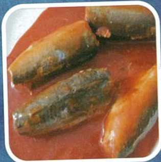
沙丁鱼罐 17 CANNED SARDINES