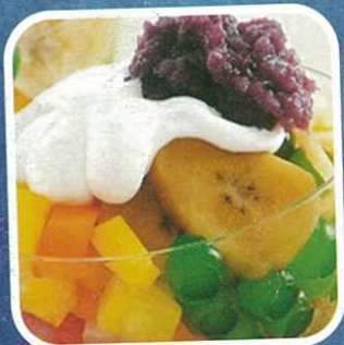
水果蜜饯 14 15 FRUIT PRESERVE