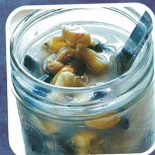
其他海产 20 OTHER SEAFOOD