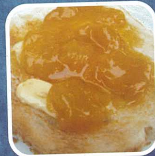
果酱 12 13 15 JAM MARMALADE