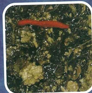
香芋叶 45 TARO LEAVES