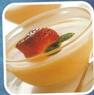
水果布丁 13 FRUIT PUDDING