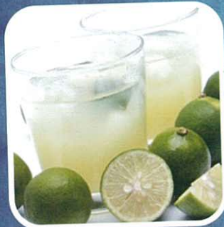
果汁 9 10 11 FRUIT JUICES