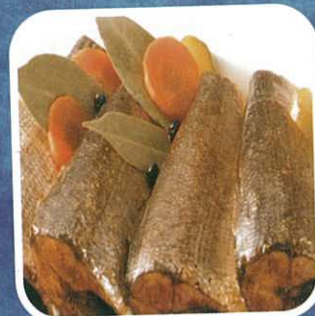
樽装鱼 19 29 45 BOTTLED FISH