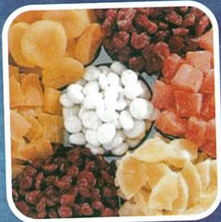
其他果干 6 7 8 OTHER DRIED FRUIT