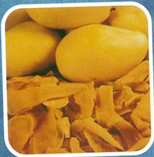
芒果干 6 7 8 DRIED MANGO